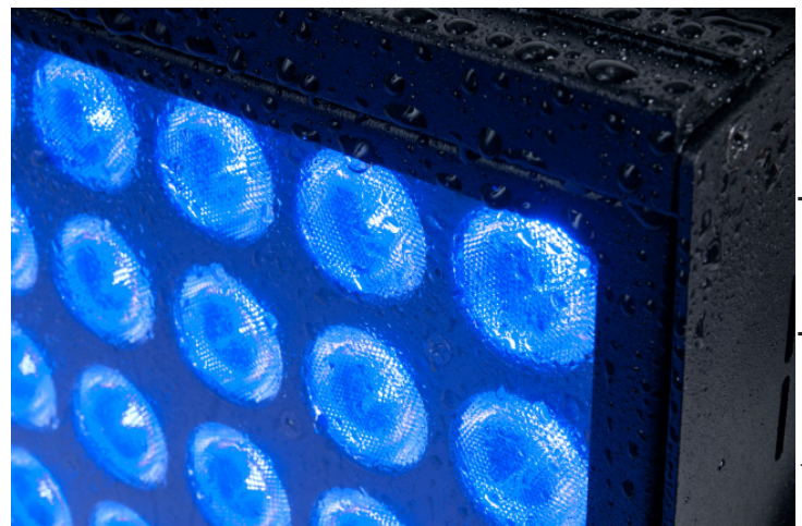
IPX4 Outdoor Rated

Specifications are subject to change without notice ©Elation Professional 01/24/19