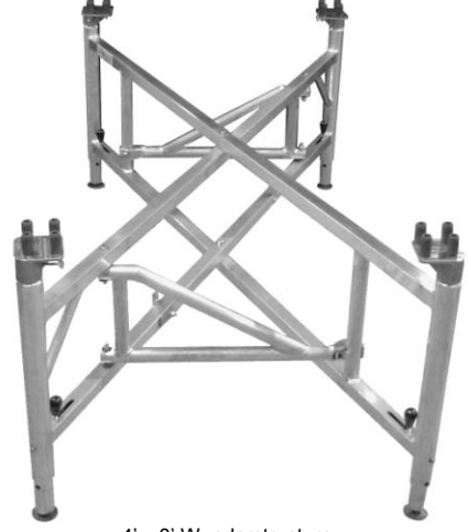
4' x 8' Wunderstructure