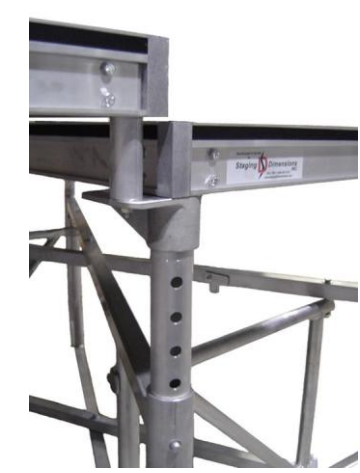
Wunderstructure Tiered Riser